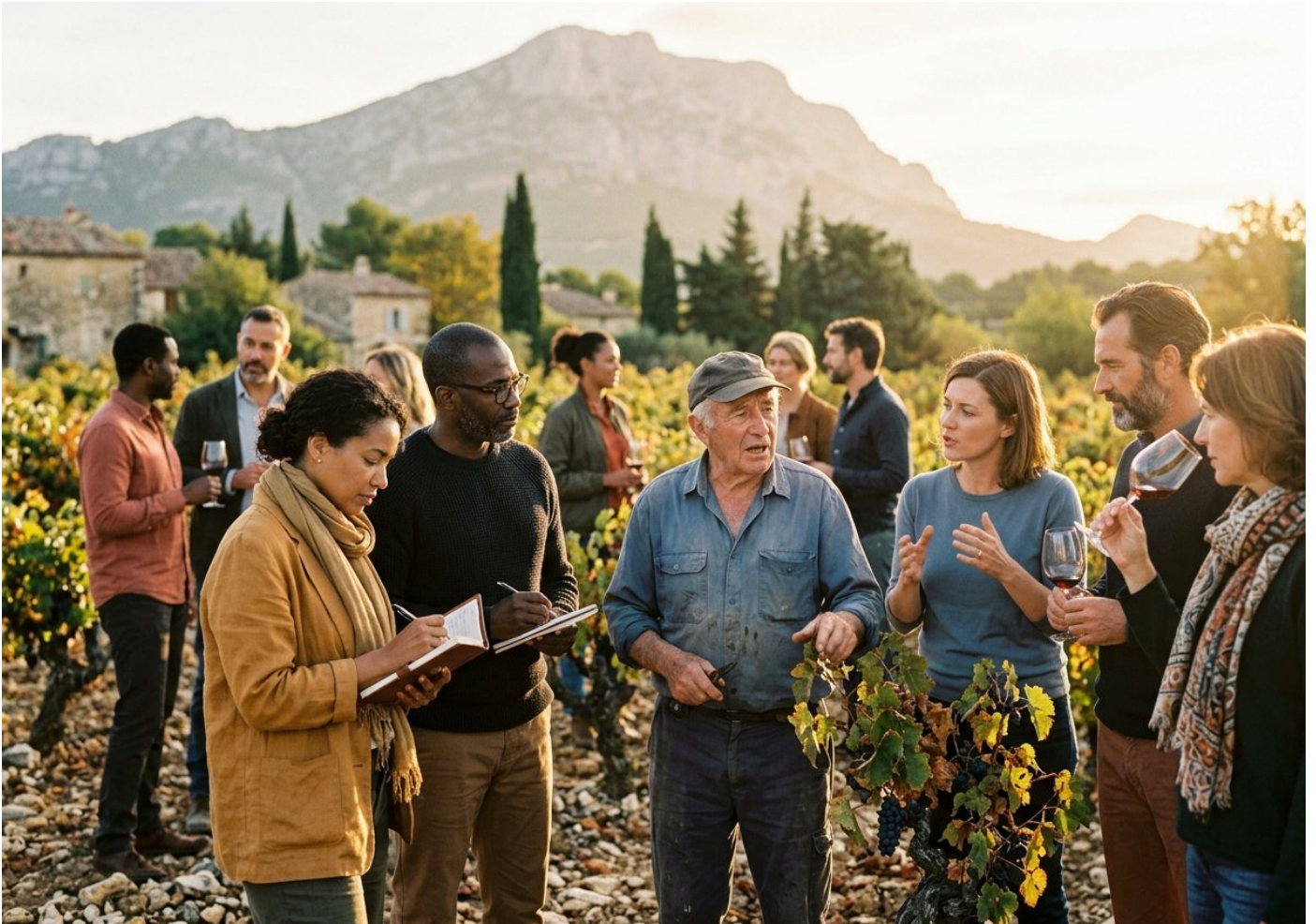
Day 1 fieldwork: participants in conversation with a vigneron, Mont Sainte-Victoire behind. The industry is the laboratory; the practice is what goes home.